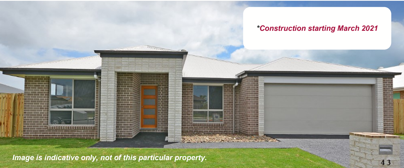
Image is indicative only, not of this particular property.