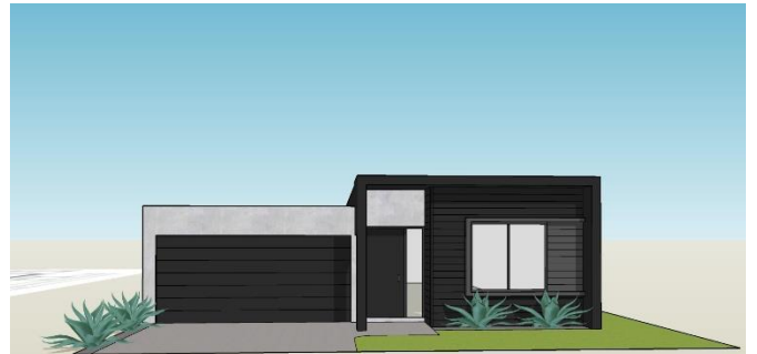
Matte Black 253