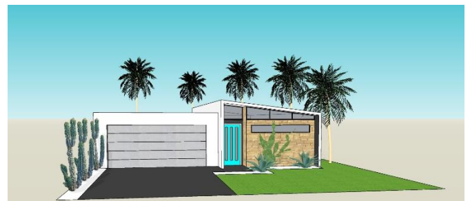
Palm Springs 253