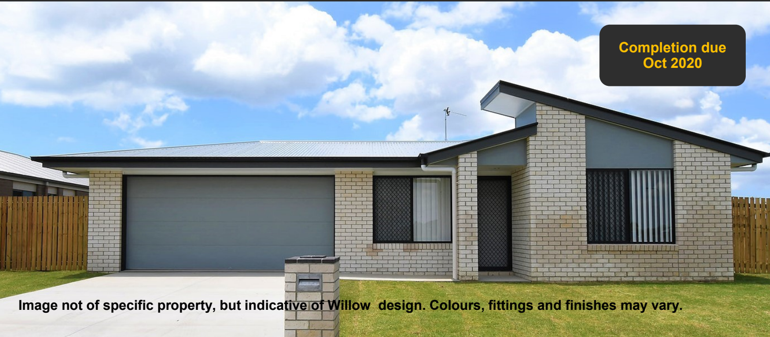
Image not of specific property, but indicative of Willow design. Colours, fittings and finishes may vary.