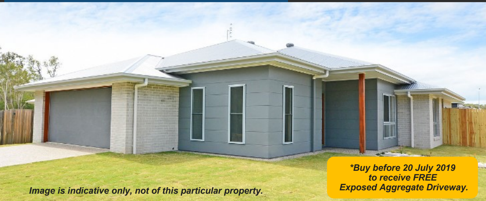
Image is indicative only, not of this particular property.

*Buy before 20 July 2019 to receive FREE Exposed Aggregate Driveway.