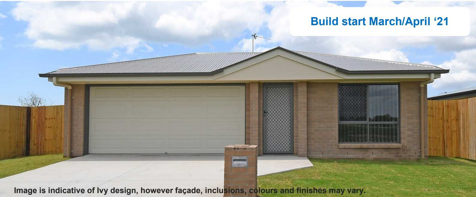
Image is indicative of Ivy design, however façade, inclusions, colours and finishes may vary.