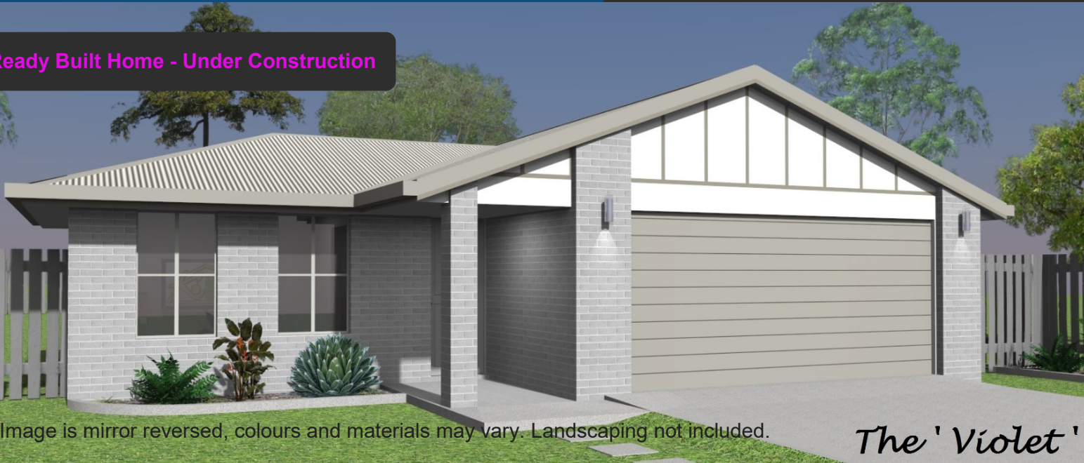
Image is mirror reversed, colours and materials may vary. Landscaping not included.